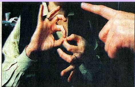
Speak to me ... the visual language.

See below the add for PCDE—there is a survey for them attached to the last page!