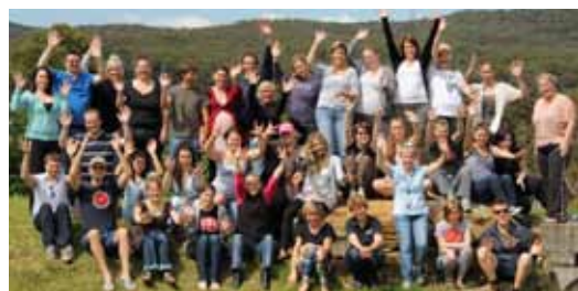
Auslan Only Weekend

On behalf of the DEN team we would like to say thank you to all our AOW participants and congratulations to all our graduating students.